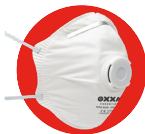
LANI 6100 Art. no. 4.05.621.00