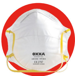
LANI 6100 Art. no. 4.05.610.00